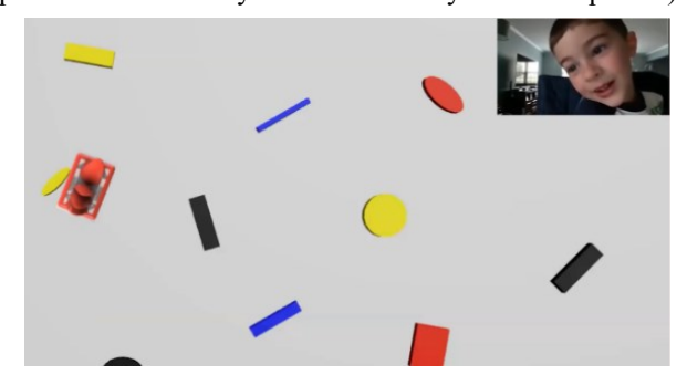
Fig. 1. Robot trial showing video chat setup. The child selects a colored shape (i.e. an obstacle) as the "treasure."

stationary, and only the robot was teleoperated. The goal of teleoperation was to allow a child to try any command he/she wanted with equal responsiveness from the robot; in this way, the robot was able to follow any command from a child that the experimenter could understand. This was done with several guidelines: a) if the child gives a direction without specifying a distance, the robot moves in that direction until it hits an obstacle or is told to stop, b) all relative directions (e.g. "left", "right", "forward") are interpreted relative to the robot's orientation, and c) vague directions like "a little bit" or "more" moved the robot approximately one inch on a laptop screen. Specific directions "five spaces" were arbitrarily defined upon first use, and then scaled if the child used distance commands a second time (e.g. "20 spaces" is four times the distance the experimenter arbitrarily travelled initially for "five spaces").