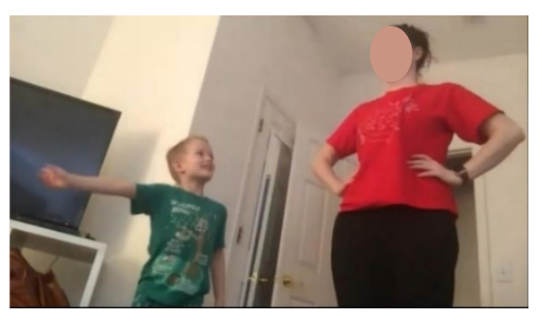
Fig. 8. A child pointing to direct their parent to the hidden treasure