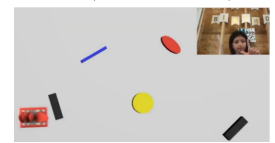
Fig. 7. Child using her hands to determine the robot's left and right

Several variables varied significantly with children's age. First, the frequency of prompts (total prompts/total commands) decreased with age (r = -.586, p < .001). Many of these prompts came from the caregivers during the person trials, where young children would give a vague command (such as "turn" or "move" ) and parents would ask leading questions to understand what to do. Prompts given during the robot game were focused on reminding the child of the task, and asking them for further commands ( "what should it do next?" ).